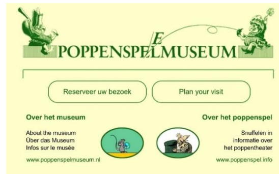
Picture: Plan your visit. Print screen website www.poppenspe(e)lmuseum.nl .

See also: https://www.poppenspelmuseumbibliotheek.nl/pdf/corona-document.pdf and https://www.poppenspelmuseumbibliotheek.nl/pdf/reserverenreservation.pdf .